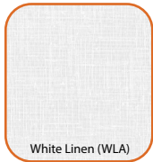
White Linen (WLA)