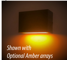
Shown with Optional Amber arrays