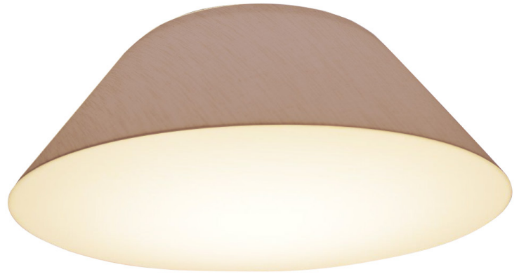
Shown with Chocolate Linen Acrylic Side Lens