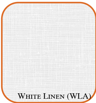
WHITE LINEN (WLA)