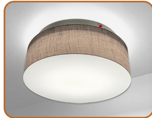
Shown with Battery Backup Extension Ring