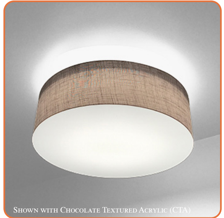
SHOWN WITH CHOCOLATE TEXTURED ACRYLIC (CTA)