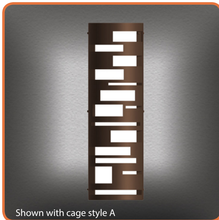
Shown with cage style A