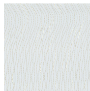
RTA Rapid Linen Acrylic