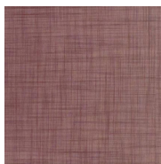
CTA Chocolate Linen Acrylic