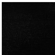
BLA Black Linen Acrylic