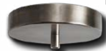
P9 Brushed Nickel Plating