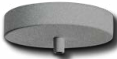
T1 Shimmer Gray