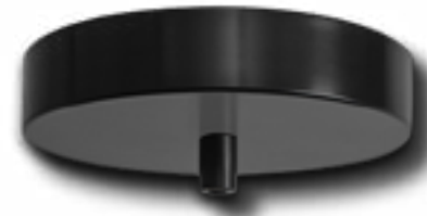
B1 Satin Black