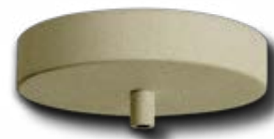
W13 Pearl Beige