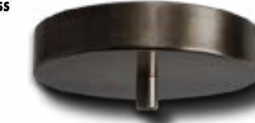
M16 Antique Brass Plating

Our premium finishes offer a sophisticated aesthetic, including the richness of brushed surfaces and the clean look of polished chrome or brass. Chrome and brass are a classic look with their highly reflective appearance. Aluminum is known for its cost effectiveness as an alternative to nickel. Antique brass adds a luxurious feel, perfect for a vintage accent in any room. Nickel plating is a great neutral choice, complementary in every surrounding. Our brushed finishes are smooth to the touch, the delicate brush strokes create a soft visual texture.