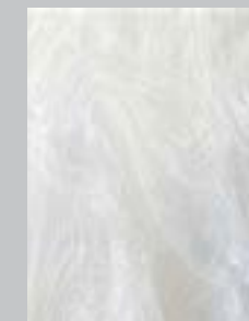
Opal Acrylic Alabaster (OAA)