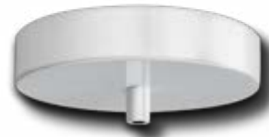
W2 Gloss White