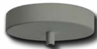
T1 Silver Gray