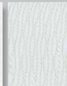
Rapid Textured Acrylic (RTA)