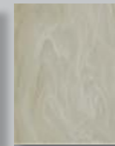
Beige Acrylic Alabaster (BAA)