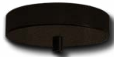
Z3 Textured Bronze