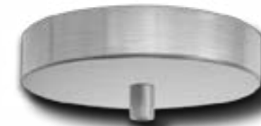
P2 Brushed Aluminum