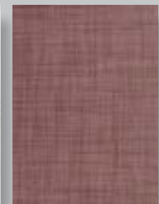
Chocolate Texture Acrylic (CTA)