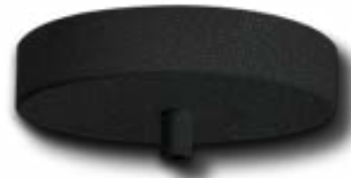
B2 Textured Black