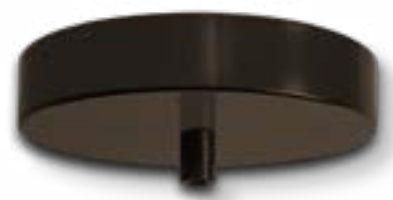
Z1 Satin Bronze