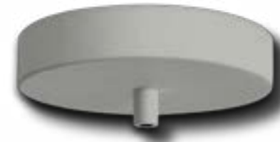
M13 Anodized Silver