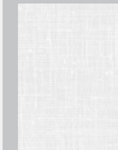
White Linen Acrylic (WLA)

* Standard Diffusers include: White Smooth Acrylic (WSA), White Textured Acrylic (WTA), White Smooth Polycarbonate (WSP), White Textured Polycarbonate (WTP)