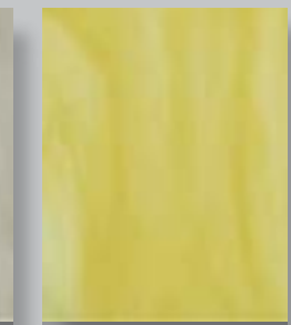
Acrylic Honey Alabaster (AHA)