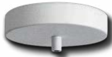
W3 Textured White