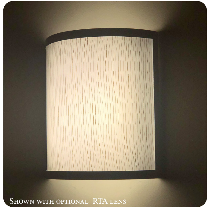
SHOWN WITH OPTIONAL RTA LENS