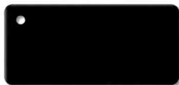
B1 Satin Black