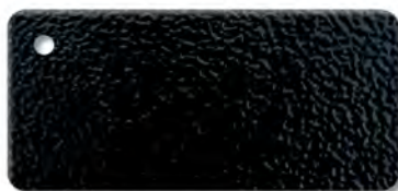
B2 Textured Black