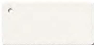
W3 Textured White