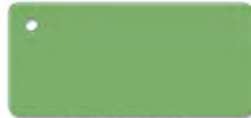
G13 Sage Green