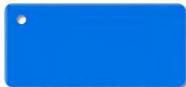
U12 Parkers Blue