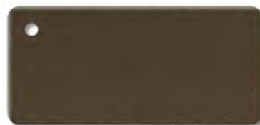
Z1 Satin Bronze