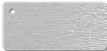
P2 Brushed Aluminum