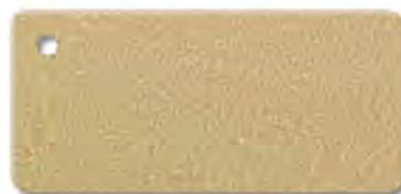
W13 Pearl Beige