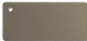
T1 Silver Gray