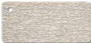
P9 Brushed Nickel