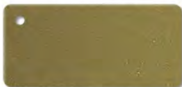
M17 Brass Powder