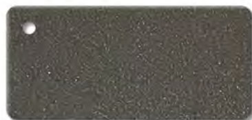
T5 Textured Silver