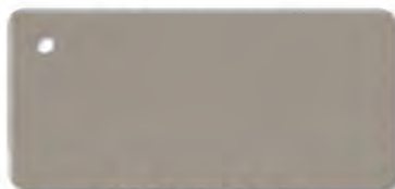
T4 Shimmer Gray