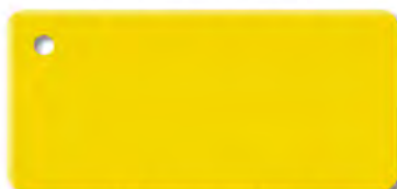
M20 Tuscan Sun