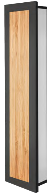
Shown with Bamboo Diffuser (DT2)