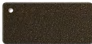
Z3 Textured Bronze