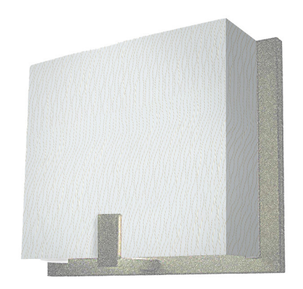
Rapid Textured Linen (RTA)