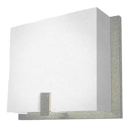
White Linen (WLA)