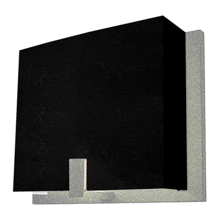
Black Linen (BLA)