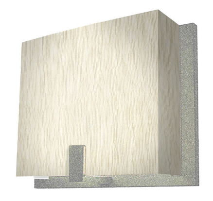
Sable Linen (SLA)