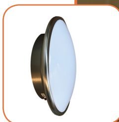
Battery Backup option