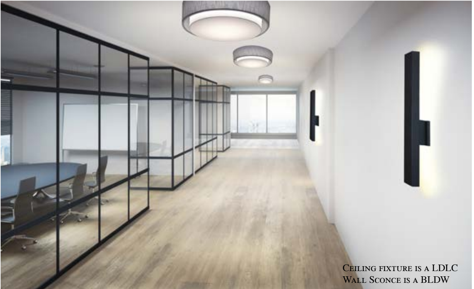
CEILING FIXTURE IS A LDLC WALL SCNCE IS A BLDW